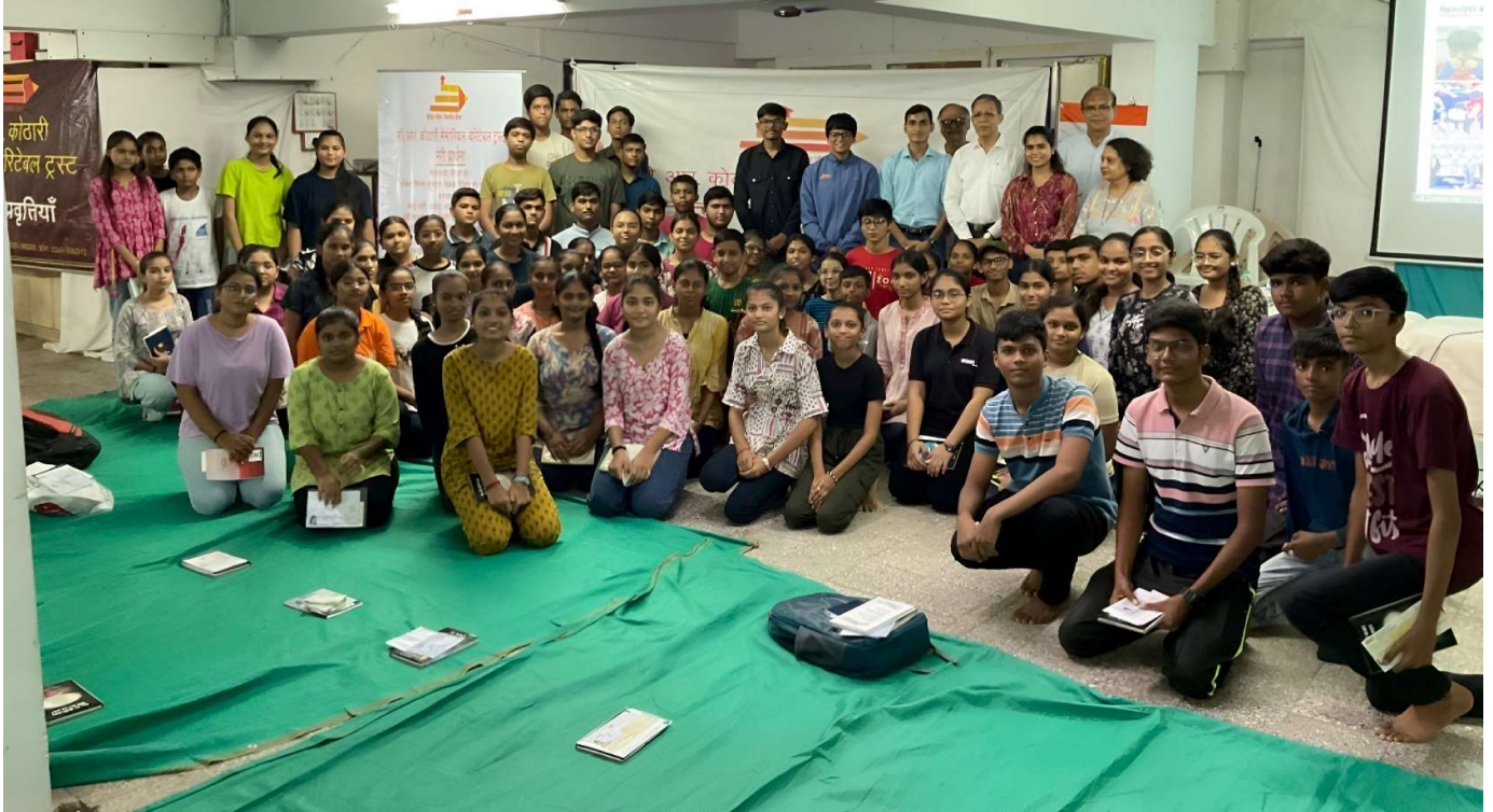
Group photo with Trust Beneficiaries