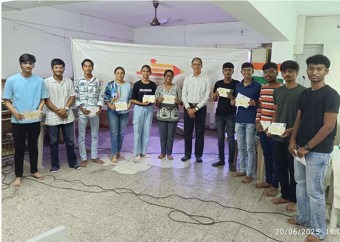
Group photo of all CA students